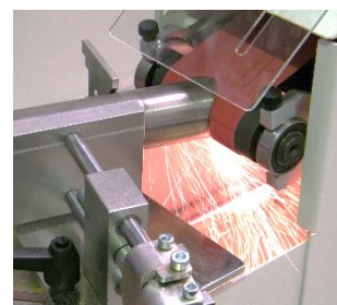
Stainless steel tube notching with CL75 + B013