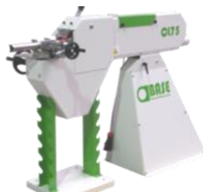
CL75 tube notching machine (CL75 + B013)